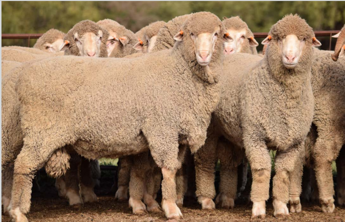
Just a few of the Rocklyn hogget rams that will be offered at the 2019 on-property ram sale on Thursday 12th September.

With in-depth knowledge of the sires and sale rams, I am more than happy to help you customise your ram selections to meet your breeding objectives and discuss ways to improve your flock.